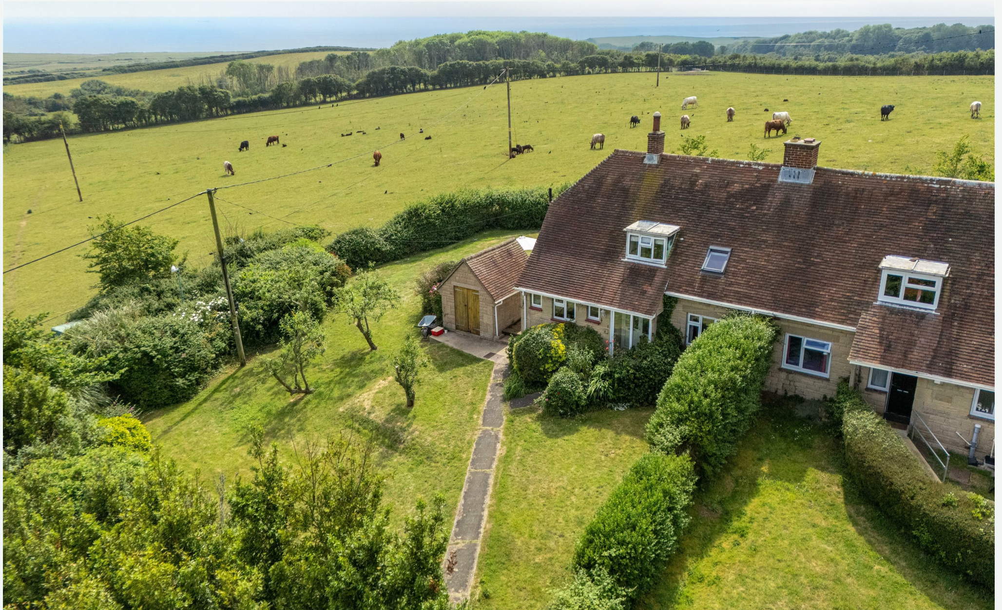
4 Mottistone Green Cottages, Mottistone, Isle of Wight